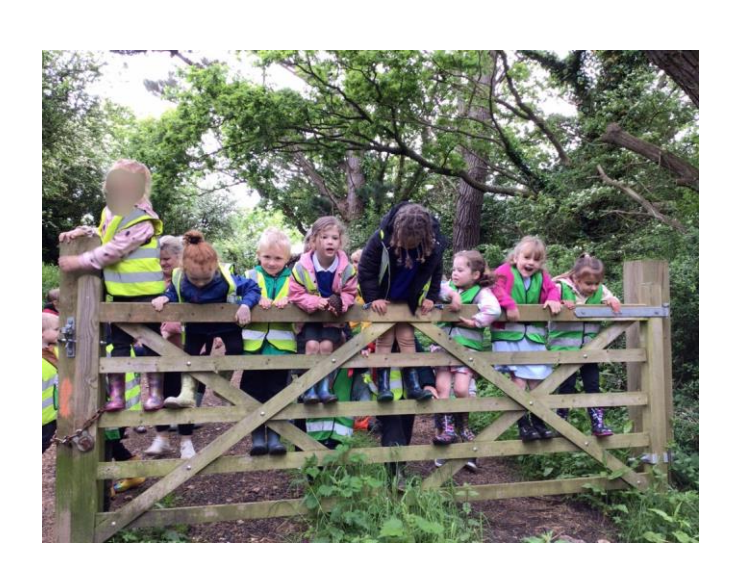
Page 7 of 7